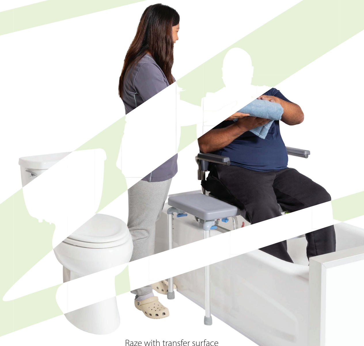
Raze with transfer surface

Raised Toilet Seat Transfer Tub Bench Shower Bench