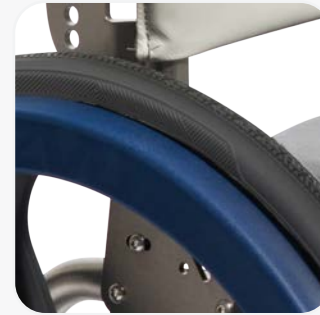
ERGONOMIC HAND RIM WITH THUMB GROOVE AND FINGER NOTCHES