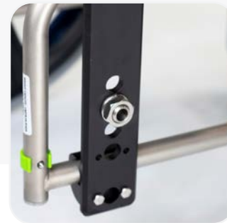
ADJUSTABLE AXEL PLATE

The Raz Mobile Shower Commode chairs are designed and manufactured to the highest standards of the discerning health care professional.