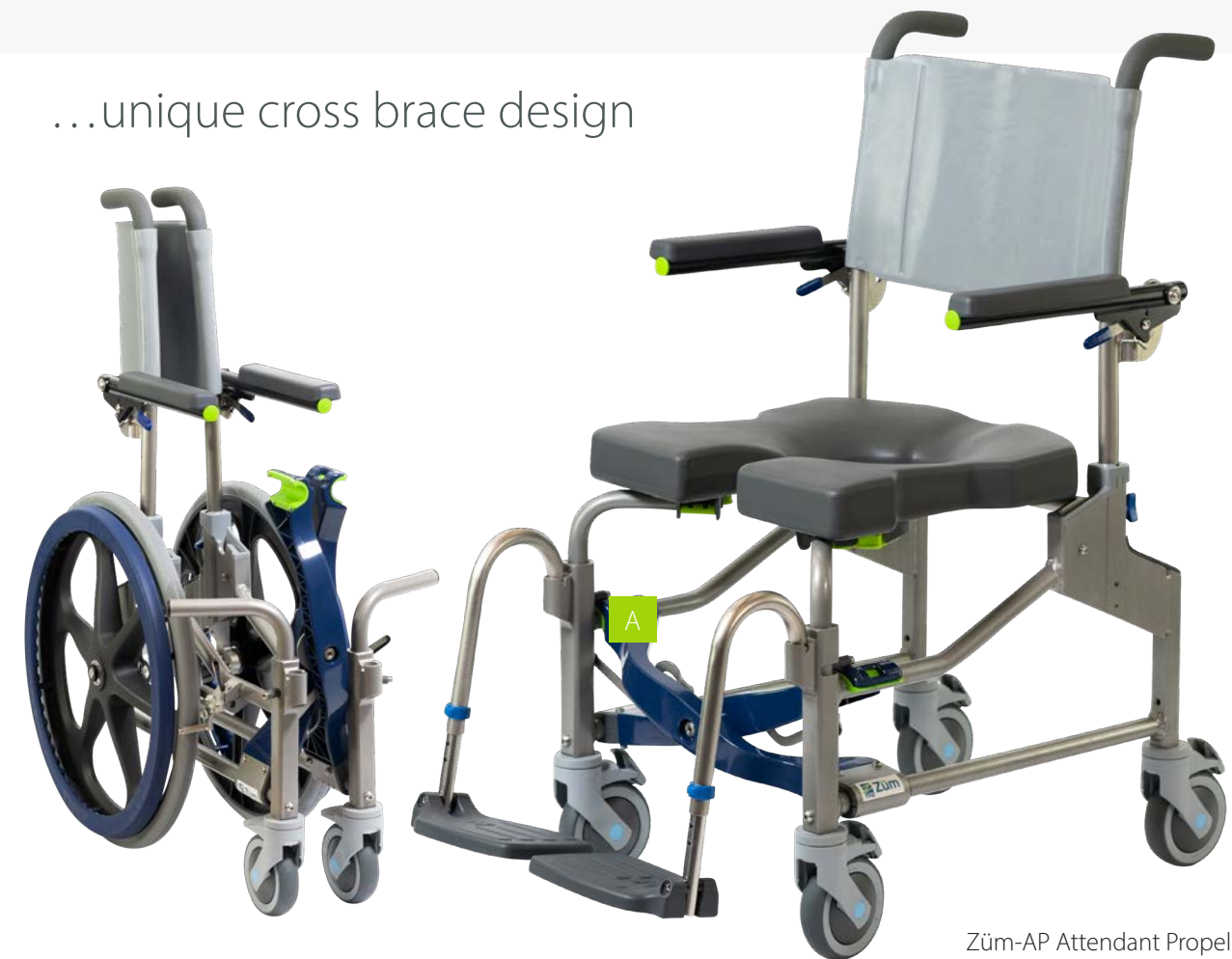
Züm-AP Attendant Propel

A The Züm's unique front cross brace is made of cast aluminum. The centre pivot is curved and positioned low and forward on the frame for better aperture/bowl alignment.