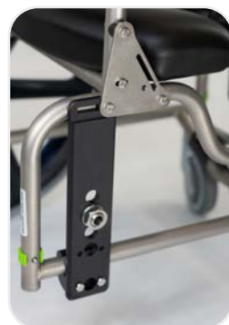
Fore / aft adjustable axle plate allows for center-of-mass (COM) adjustment

The Raz-SP600 Self Propel Bariatric Mobile Shower Commode Chair has been specifically designed for a weight capacity of up to 600 lbs. It features the Multi-Position Back (with center of gravity adjustment) The Raz-SP600 will provide maximum comfort and maneuverability for users who require a self-propelled heavy-duty shower commode chair.