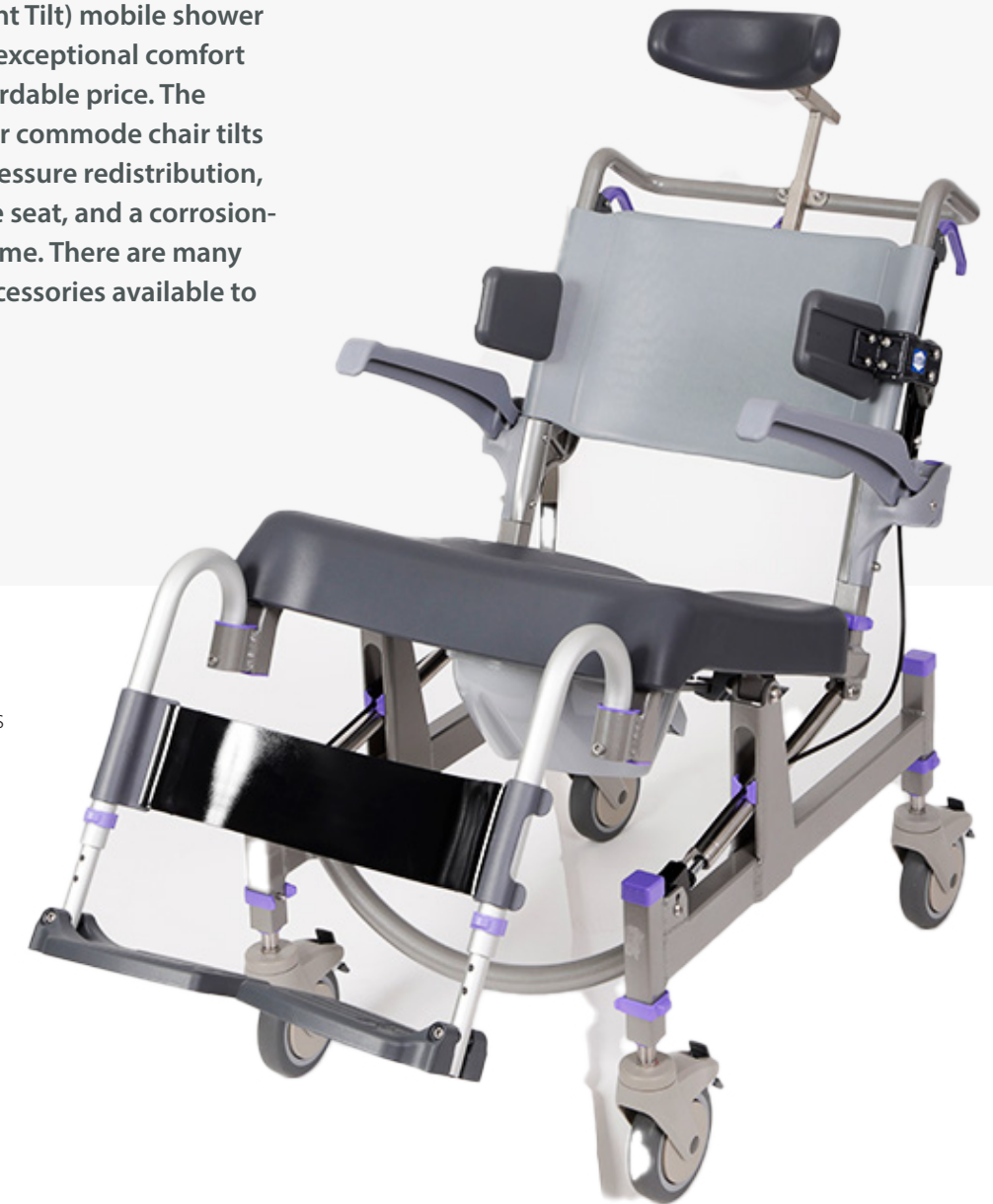
EZPZ-AT shown with Optional Soft Seat, Laterals and Snap-On Infection Control Calf Strap

The EZPZ- AT (Attendant Tilt) mobile shower commode chair offers exceptional comfort and function at an affordable price. The EZPZ-AT mobile shower commode chair tilts up to 35° to provide pressure redistribution, a contoured composite seat, and a corrosion-resistant aluminum frame. There are many quality options and accessories available to meet individual needs.