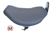
M Fixed Arm with Small Pad NMAPS-LPS