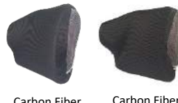
Carbon Fiber Standard Contour Carbon Fiber Deep Contour