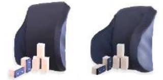
Standard Contour Deep Contour