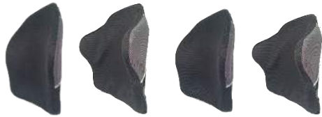
Standard Contour Deep Contour Low Standard Contour Low Deep Contour