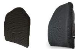
Kids Contour Standard Contour