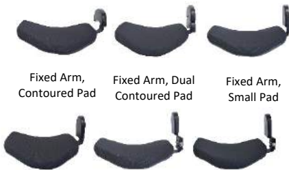
Fixed Arm, Contoured Pad Fixed Arm, Dual Contoured Pad Fixed Arm, Small Pad Fixed Arm, Large Pad Swing Away Arm, Small Pad Swing Away Arm, Large Pad