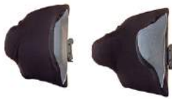
Standard Contour Deep Contour