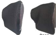
Standard Contour Deep Contour