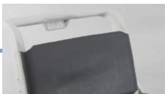
Soft and flexible back support – comfortable and easy to clean