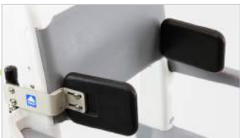
Swing-away laterals – provide lateral trunk support