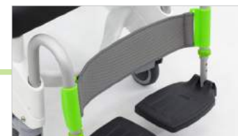
Snap-on Bodypoint Calf strap – dries quickly