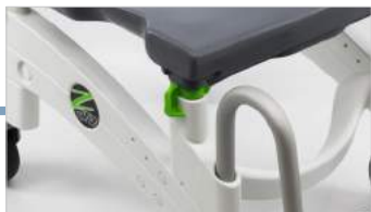
Molded, composite frame – durable and easy to clean