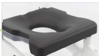
SoftJaz seat overlay – molded and contoured for pressure distribution and unrivaled comfort