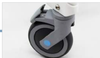
Dual-locking casters (swivel and roll) – stabilize chair for toileting, bathing and transfers