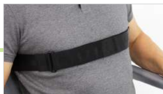
Chest belt – One-piece with hook and loop fastener