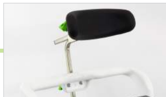
Head support – molded pad with fixture, adjusts in height and fore/aft