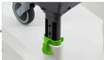
Height-adjustable without tools – for toilet bowl clearance and matching transfer heights