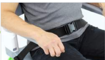
Pelvic positioning belt with side-release buckle