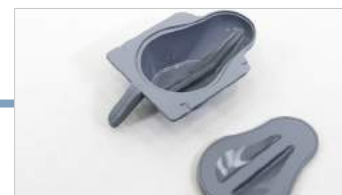
Commode pan with lid – includes anti-splash baffle and high-gloss surface to ease cleaning