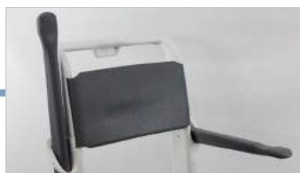
Flip-up arm supports – aids in transfers