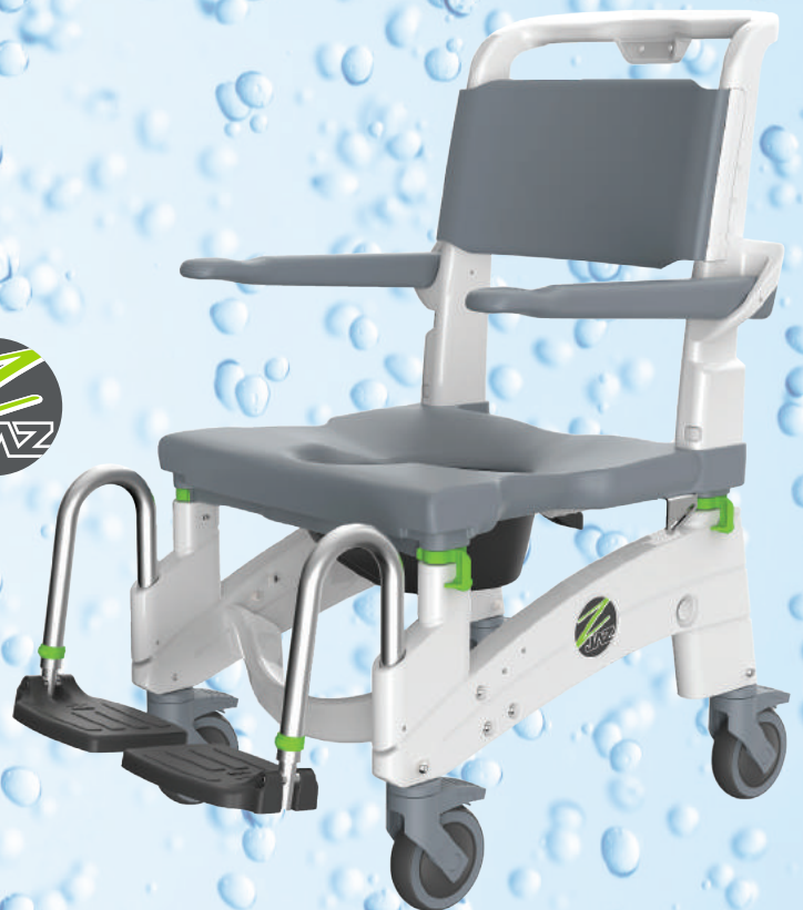
Jaz-AP Attendant Propelled