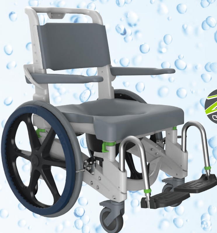
Jaz-SP Self Propelled (shown with optional SoftJaz Seat Overlay)