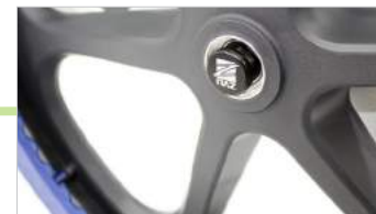
Quick-release axles (Jaz-SP) – makes transporting the chair easier