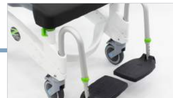
Swing-in/Swing-out – removable foot supports – facilitates transfers