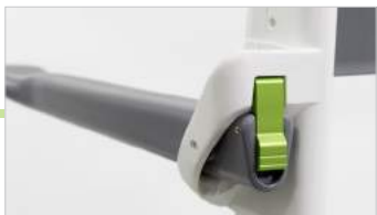
Arm support locks – provide more security during transfers