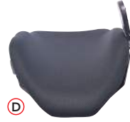
D Short Swing-Away Arm with Large Pad NLASS-NLPSL