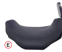
E Extendable Swing-Away Arm with Large Pads NLASA-NLPSL