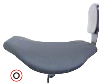
O Fixed Arm with X-Large Pad NMAPS-DLTSF