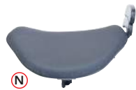
N Fixed Arm with Dual Contoured Pad NMAPS-LCS