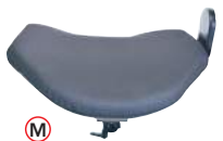
M Fixed Arm with Small Pad NMAPS-LPS