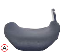
A Short Fixed Arm with Small Pad NLAFS-NLPHS