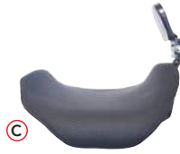
C Short Swing-Away Arm with Small Pad NLASS-NLPSS