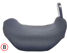
B Short Fixed Arm with Large Pad NLAFS-NLPHL