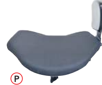
P Swing-Away Arm with X-Large Pad NMAPS-DLTSS